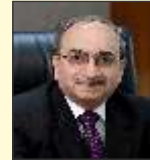
Shri Dinesh Kumar Khara Chairman State Bank of India Mumbai