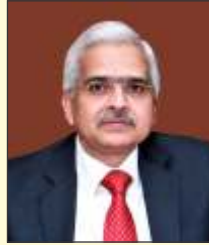
Shri Shaktikanta Das Governor Reserve Bank of India Chairman NIBM Governing Board